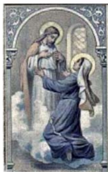
Angela of Foligno

"Human perfection consists in knowing the greatness of God and our own nothingness."