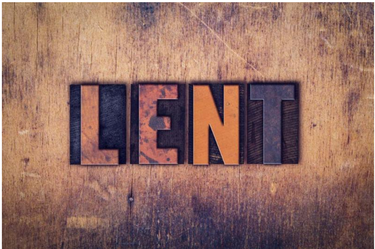
Renata Sedmakova Shutterstock.com