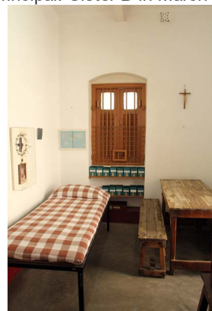
Room of Mother Teresa